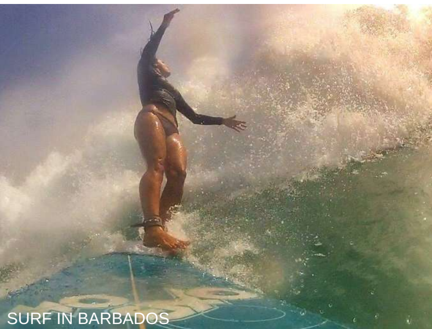
SURF IN BARBADOS